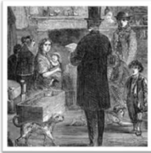
A census enumerator in a Gray's Inn Lane tenement, London

A census has taken place in England every ten years since 1801 (with the exception of 1941).