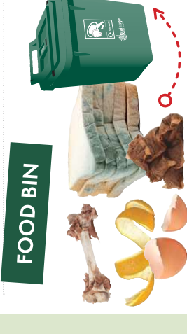
Correct at time of publication 5.9.2024. Please check www.braintree.gov.uk for any changes.